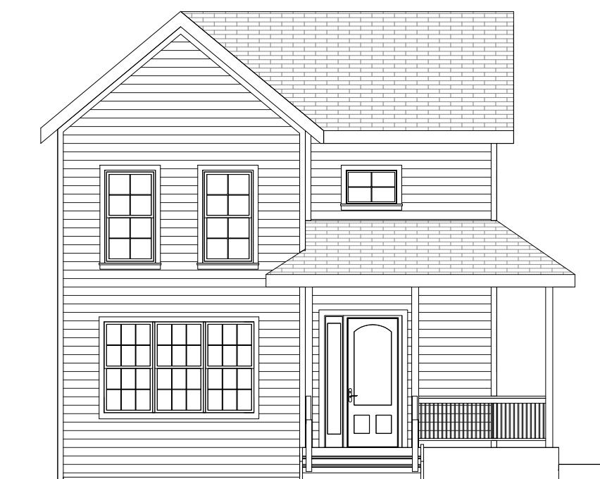
③ SOUTH ELEVATION 1/8" = 1'-0"