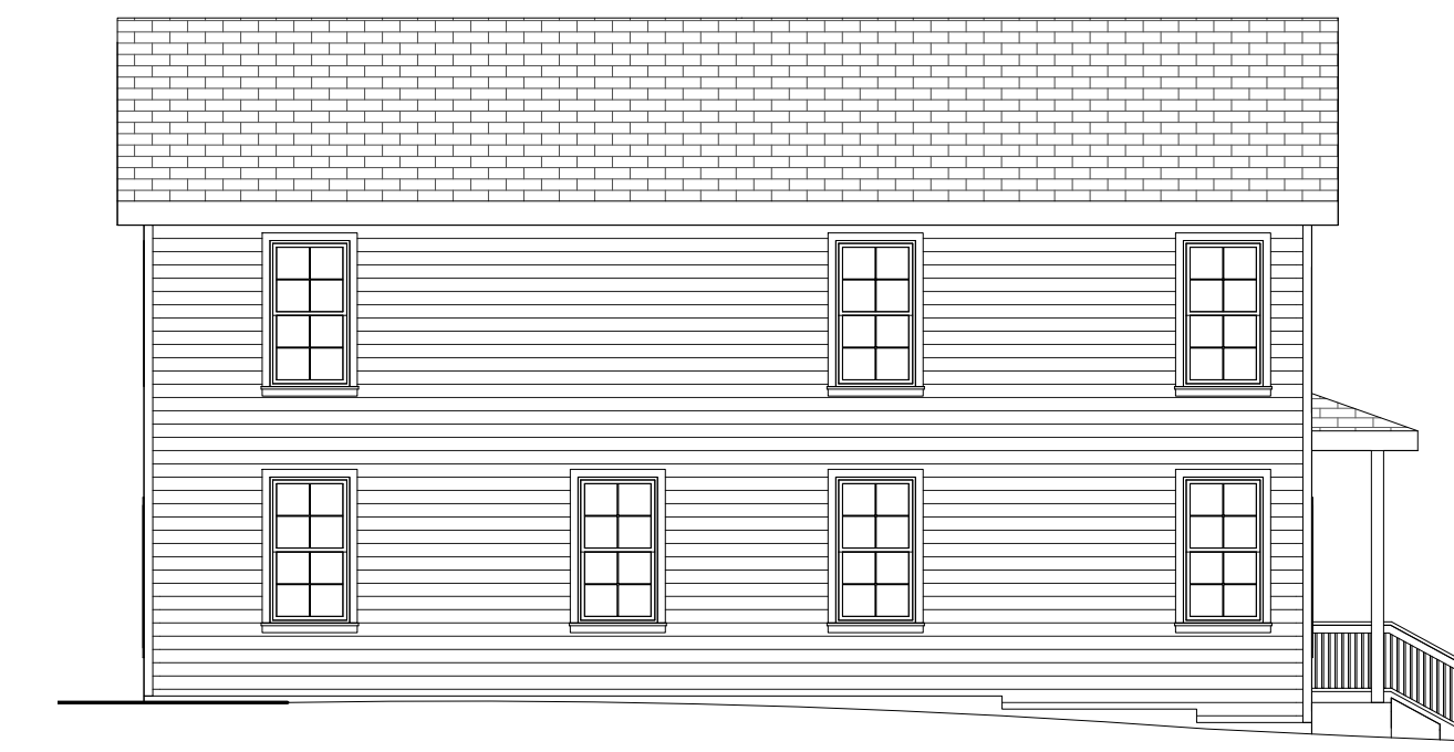
④ WEST ELEVATION 1/8" = 1'-0"