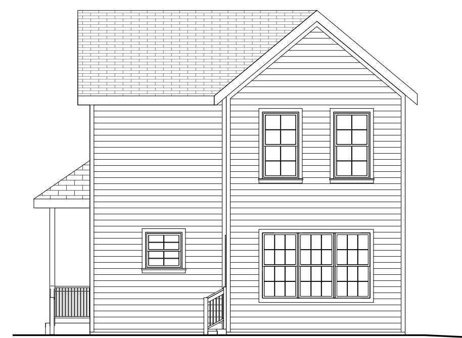
① NORTH ELEVATION 1/8" = 1'-0"