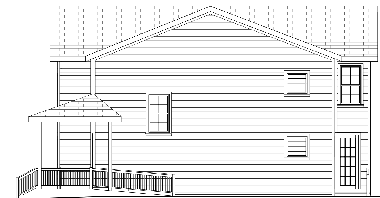
② EAST ELEVATION 1/8" = 1'-0"