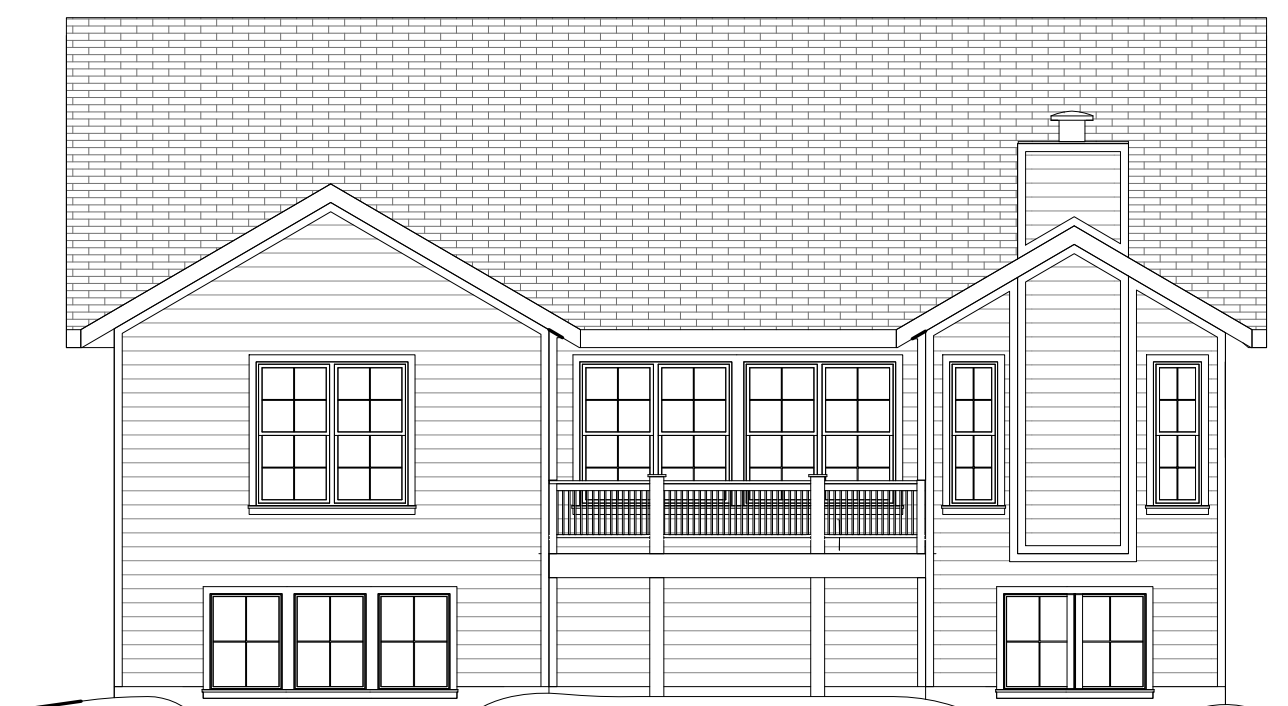
③ NORTH ELEVATION 1/8" = 1'-0"