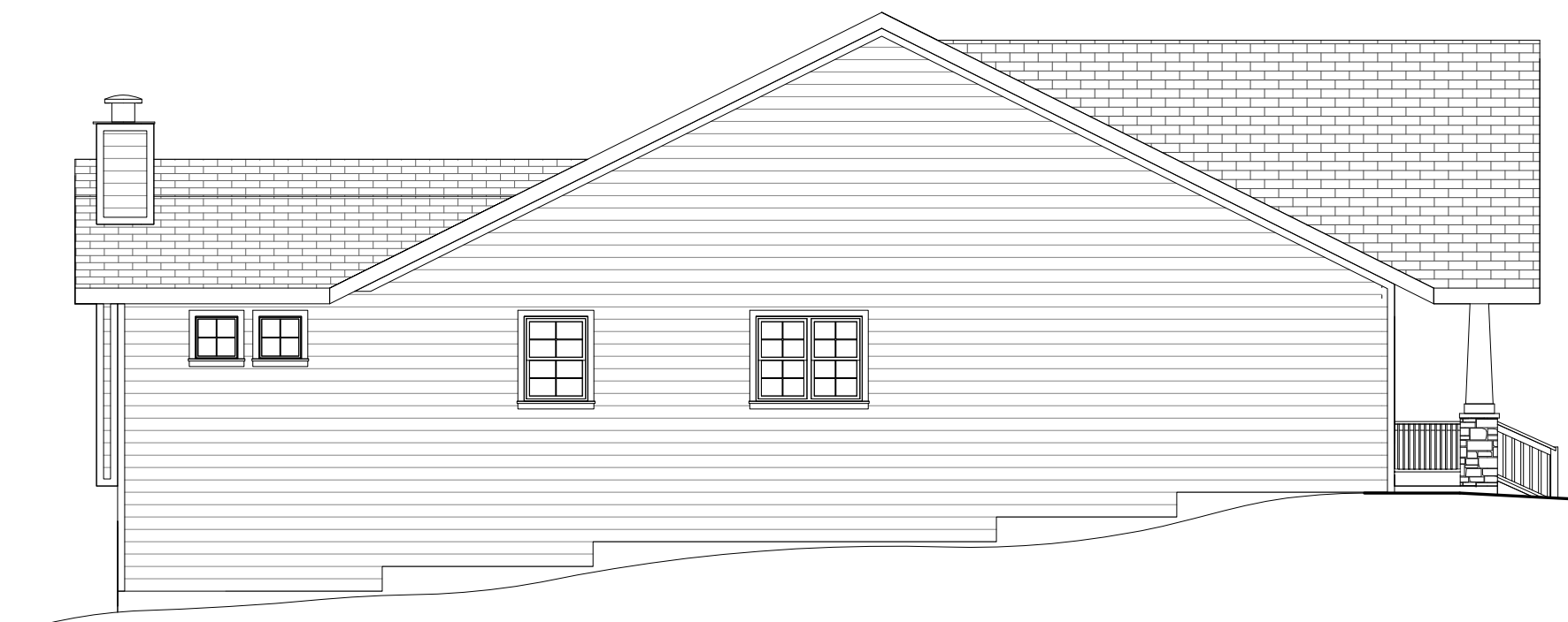
② WEST ELEVATION 1/8" = 1'-0"