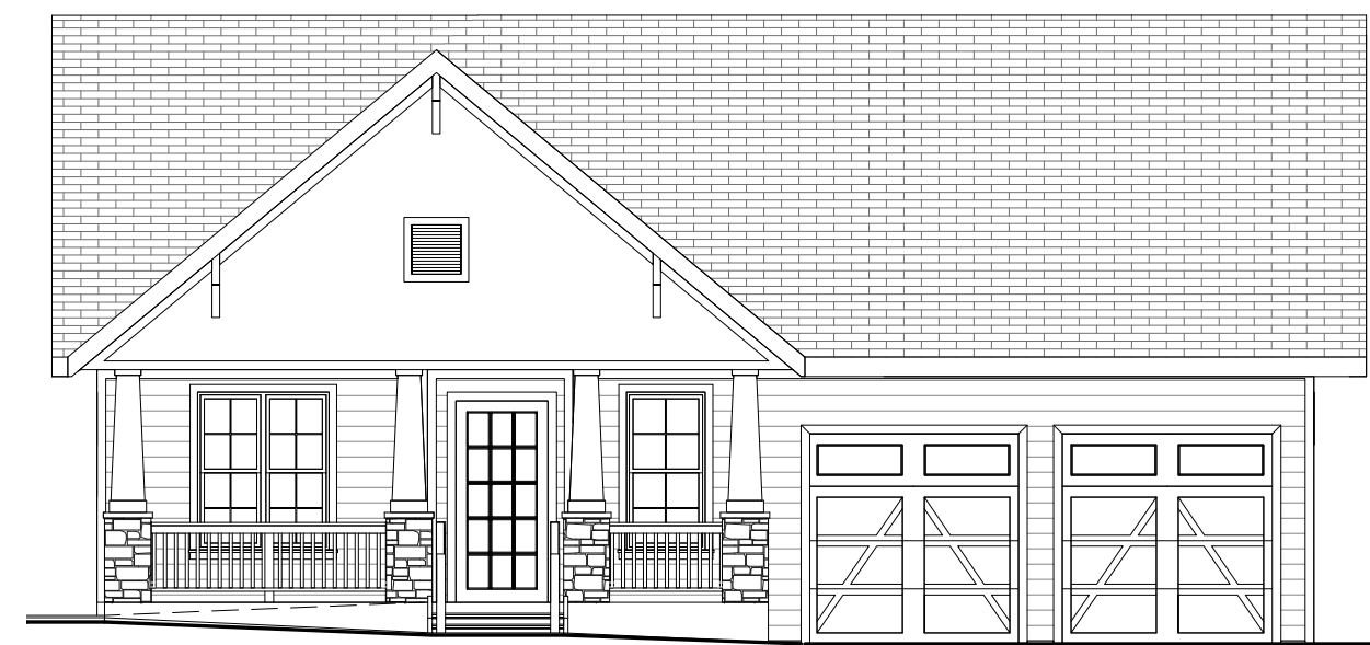
① SOUTH ELEVATION 1/8" = 1'-0"