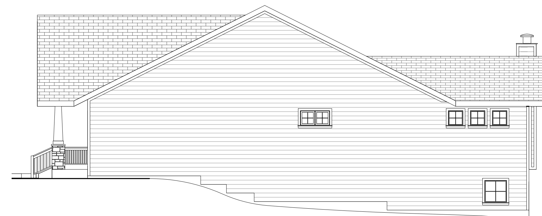
④ EAST ELEVATION 1/8" = 1'-0"