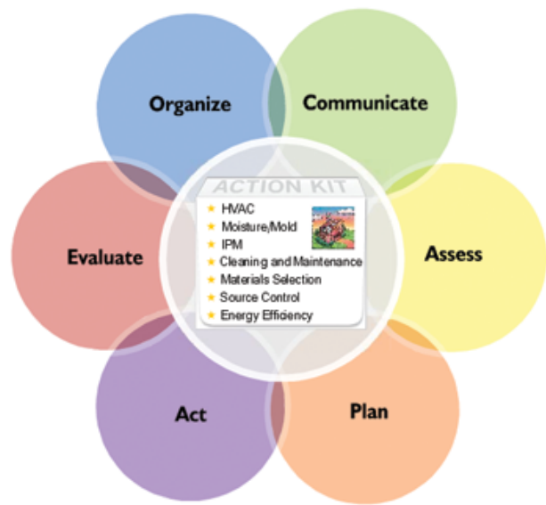
Figure 2: The Framework for Effective School Indoor Air Quality Management developed by the U.S. EPA. The framework includes specific guidance for mitigating IAQ issues in schools.

To assist in this process, organizations like the U.S. Environmental Protection Agency (EPA) and the American Society for Healthcare Engineering (ASHE) have developed guidance for specialized facilities like schools 10 , health care environments 11 , and the home 12 . These tools help: identify common IAQ issues found in these building types, develop communication plans to link occupants with operations and maintenance staff, provide guidance on how to assess and address potential problems, and encourage ongoing evaluation of IAQ (Figure 2).